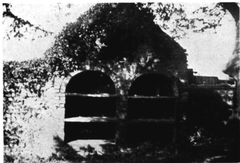
The Ferns, Eynsford.