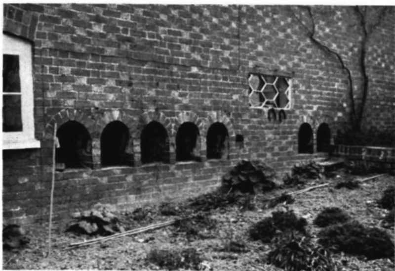
(b) Boroughs Oak Farm, East Peckham.