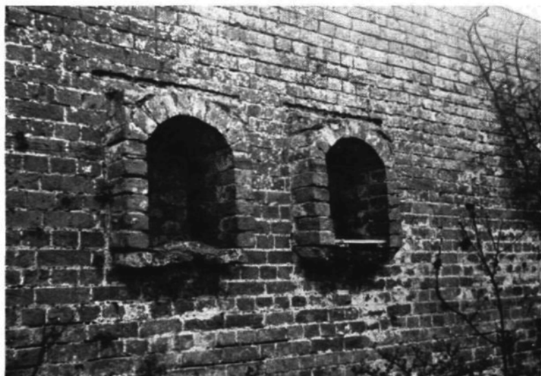
(b) The Yews, Boxley.