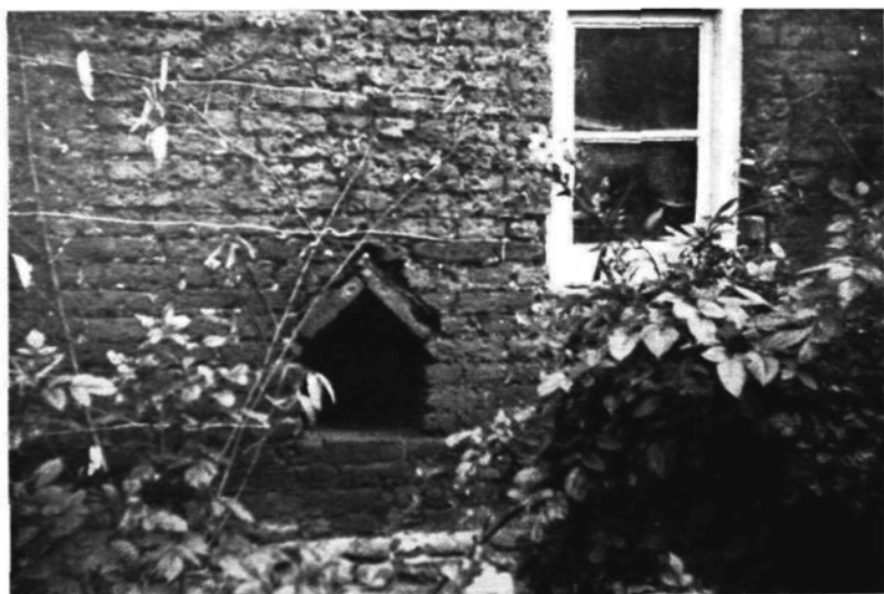
(a) Quebec House, Westerham.