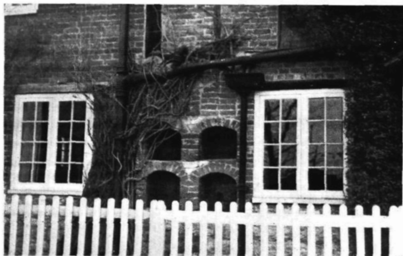
(a) Nearly Corner, Heaverham.