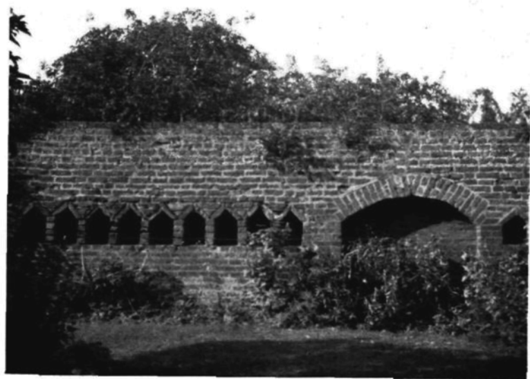
(b) Scadbury Manor, Southfleet.